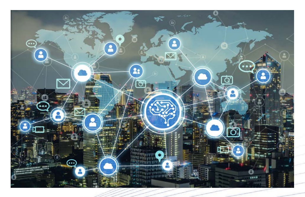
Figure 7 Proliferation of intelligence — ubiquitous smart core

By 2030, we will see more smart terminals, including smart personal and household devices, sensors in cities, unmanned vehicles, and smart robots. Unlike current smartphones, these new terminals will not only transmit data at high speeds, but also work with and learn from various smart devices. The number of devices connected through the 6G network is expected to reach trillions in the future. Through continuous learning, communication, cooperation, and competition, these devices can efficiently simulate and predict physical world