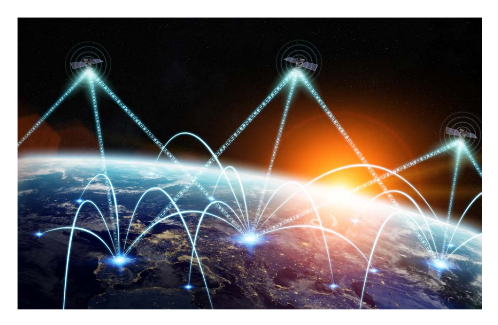
Figure 9 Global seamless coverage — three-dimensional connections

broadband access anytime and anywhere, particularly for remote areas, airplanes, UAVs, vehicles, and ships. It can also enable wide-area IoT access in areas not covered by terrestrial networks, ensuring emergency communications, crop monitoring, endangered animal monitoring in uninhabited areas, as well as collection of information on marine buoys and ocean containers. In addition, centimeter-level positioning will enable high-precision navigation and precise agriculture. With high-precision surface imaging of the earth, services such as emergency rescue and traffic dispatching can also be implemented.