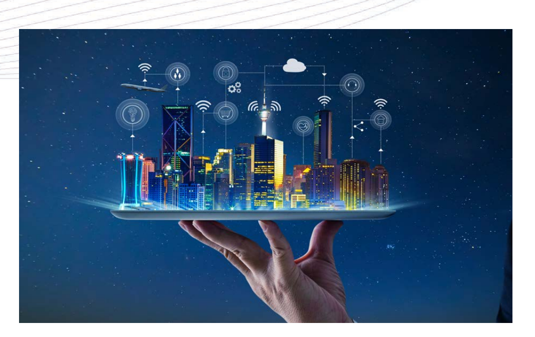
Figure 8 Digital twins — digital mirror of the physical world

factors and improve production as well as utilization of the land. In network O&M, networks can quickly adapt to complex and dynamic environments through physical and digital interaction, cognitive intelligence, and automatic O&M, bringing autonomy throughout the O&M lifecycle, from planning to construction, monitoring, optimization, and self-healing.